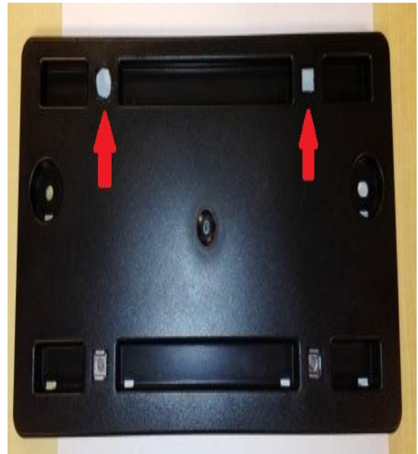
Figure 1. Damaged screw inserts.

Damaged warranty parts have been returned to Audi of America with evidence of excessive torque used when installing the screw and/or excessive screw length (Figure 1).