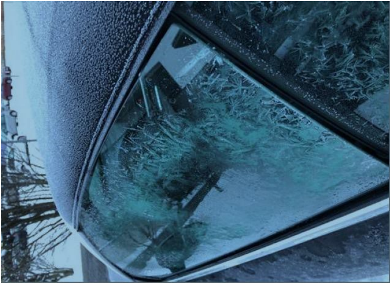
Figure 3. Solvent-free de-icer spray melts snow and ice to eliminate blockages.