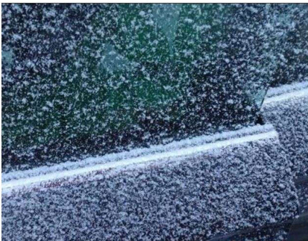
Figure 1. Snow and ice build-up on window and window slot seal surfaces.

Due to snow and ice adhesion the window and window slot seal can be bonded, resulting in a blockage that can render the window auto-drop function inoperative (Figure 2).