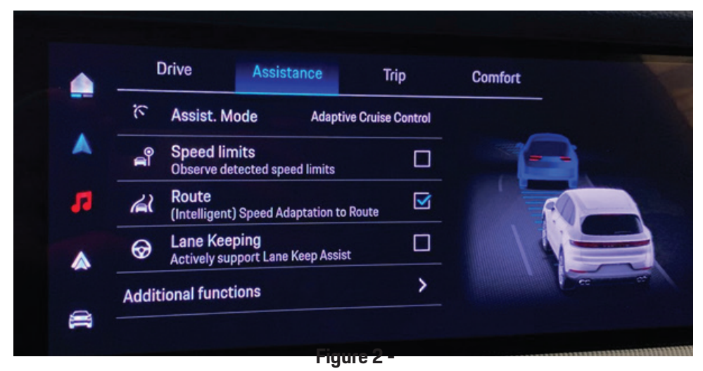
Active Lane Keep Assist available after component protection commissioning

The PCM menu should now show the option for ALKA: