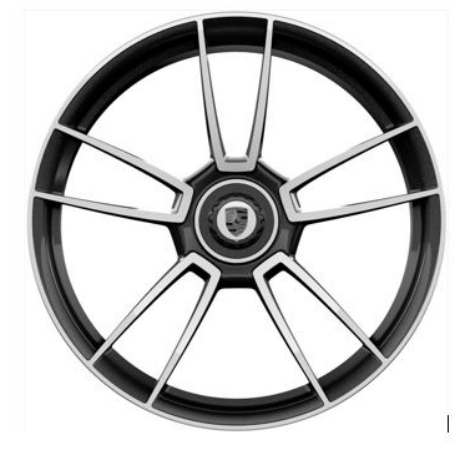
Turbo S 4

RA: 11J x 21, RO 66 (summer) Part No. 992.601.025.AC