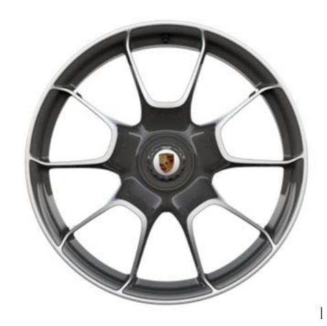
Turbo S Exclusive Design