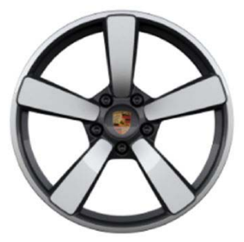
Carrera Exclusive Design

RA: 11.5J x 21, RO 67 (summer) Part No. 992.601.025.L_FFF