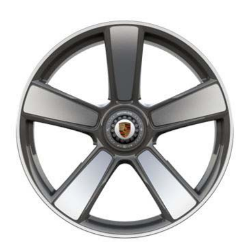
Turbo Exclusive Design

RA: 12J x 21, RO 70 (summer) Part No. 992.601.025.AJ_FFF