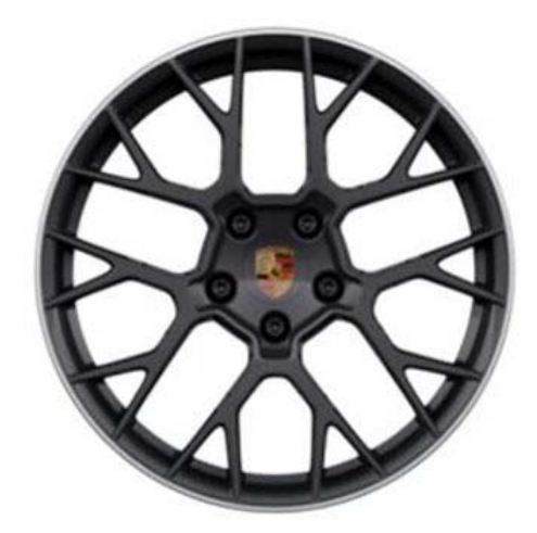
RS Spyder Design 2

RA: 11.5J x 21, RO 67 (summer) Part No. 992.601.025.G_FFF