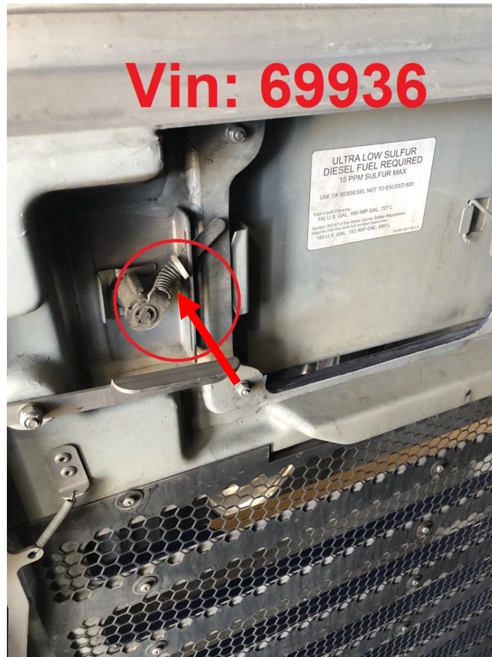
Figure 3: Spring on latch as shown.