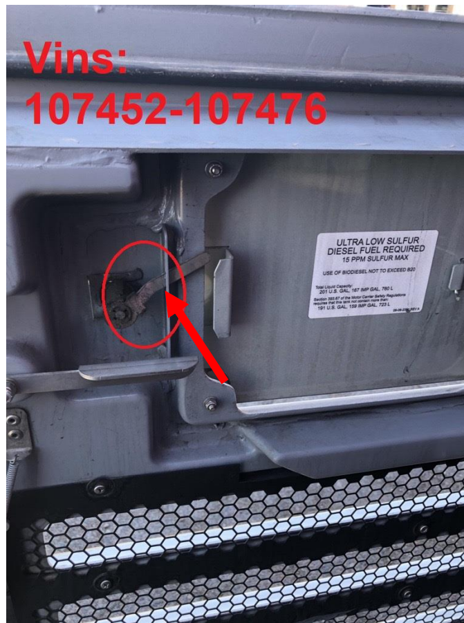
Figure 2: Missing spring on latch.