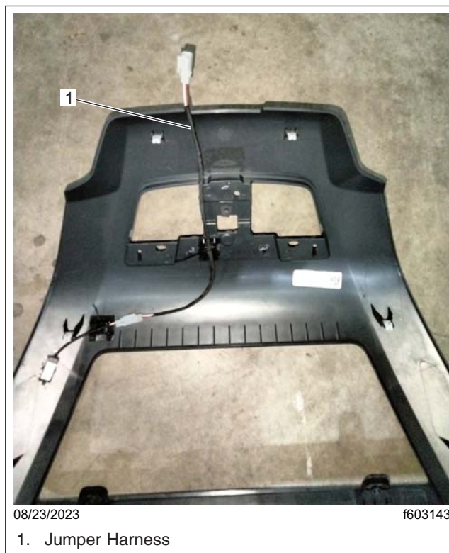
Fig. 7, Installation of the Jumper Harness