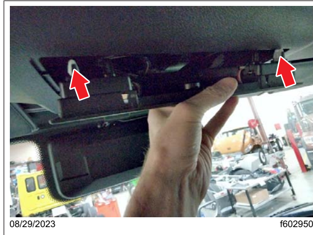
Fig. 2, Retaining Clips

2.3 Disconnect the lamp harness. See Fig. 3 .