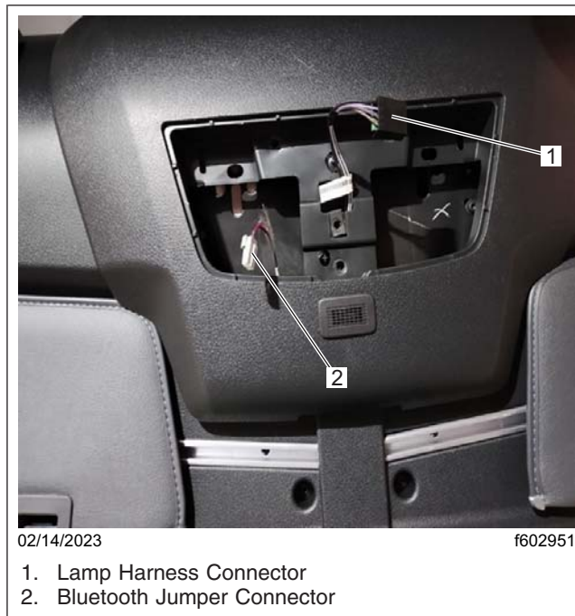
Fig. 3, Disconnecting the Harness

2.3 Disconnect the lamp harness. See Fig. 3 .