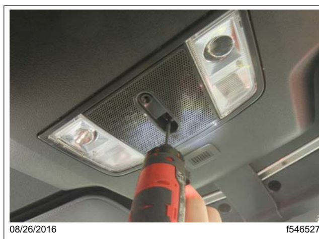
Fig. 1, Fastener Removal