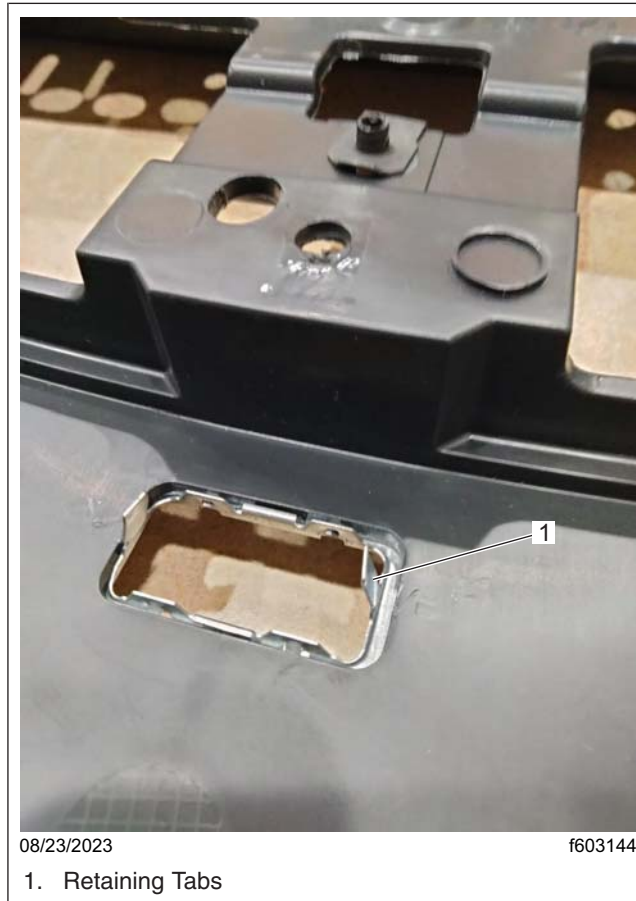
Fig. 6, Bezel Without Cover