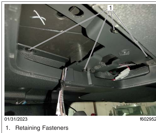
Fig. 4, Removal of the Retaining Fasteners