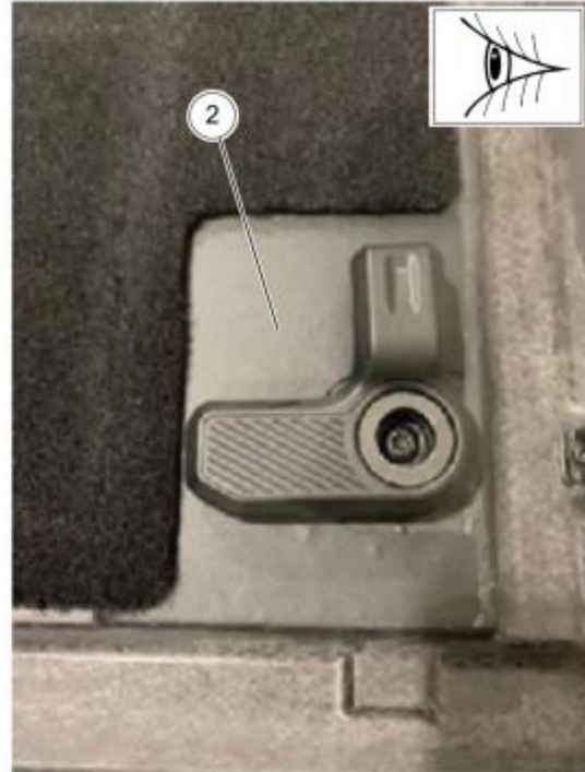
Figure 2 - View of the latch decal locations on the Bronco 3-door hard top roof