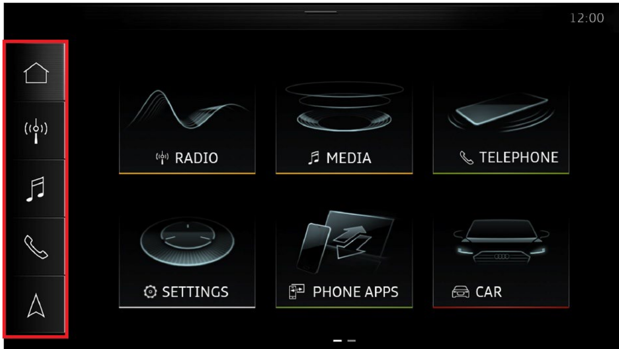
Figure 1: MMI sidebar