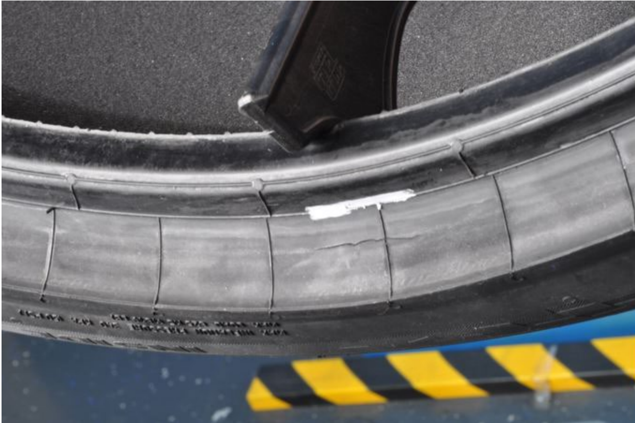
Figures 1 to 4: Cracks in the sidewall