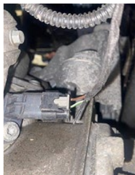
Figure 1: G701 Wire damage.