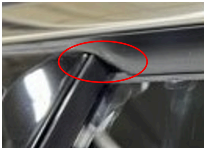
Fig. 2 Molding "Step" At The Top Of The Glass