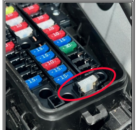
No Good (not secured)

CONSUMER NOTICE: The information and instructions in this bulletin are intended for use by skilled technicians. Mazda technicians utilize the proper tools/ equipment and take training to correctly and safely maintain Mazda vehicles. These instructions should not be performed by "do-it-yourselfers." Customers should not assume this bulletin applies to their vehicle or that their vehicle will develop the described concern. To determine if the information applies, customers should contact their nearest authorized Mazda dealership. Mazda North American Operations reserves the right to alter the specifications and contents of this bulletin without obligation or advance notice. All rights reserved. No part of this bulletin may be reproduced in any form or by any means, electronic or mechanical---including photocopying and recording and the use of any kind of information storage and retrieval system ---without permission in writing.