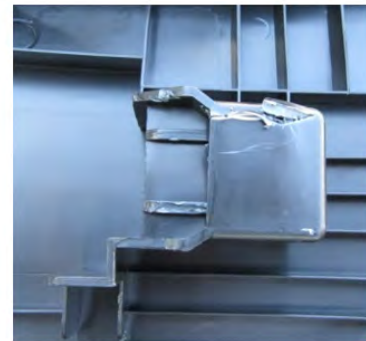
Enlarged View of Damaged Claw