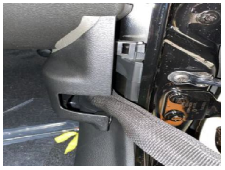
Fig. 1 Trim Panel Not Properly Seated

1. Visually inspect the right front door harness wire cover for large gaps and not properly seated (Fig. 1).