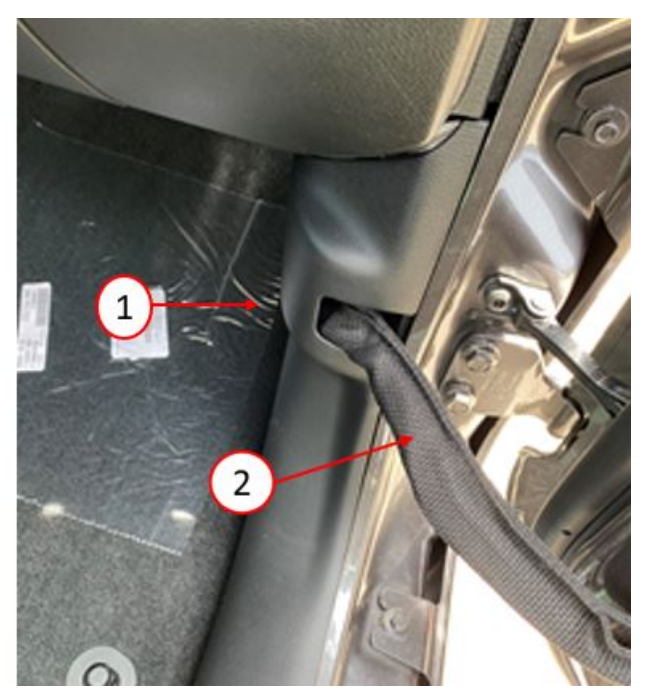
Fig. 2 Trim Panel Location