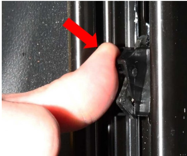
Fig. 1 Seat Position Return Removal