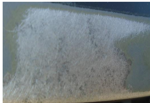
Perforation/Pitting Found After Sanding Examples (Fig. 1)

Note: If pitting is found during the sanding process, please use LOP 23-75-21-01 for up to 0.5 hours in conjunction with the 23-85 replacement LOP.