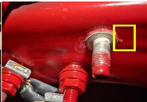
Weld Spatter Causing Poor Eyelet Connection.

This document does not authorize warranty repairs. This communication documents a record of past experiences. STAR Online does not provide any conclusions about what is wrong with the vehicle. Rather, it captures all previous cases known that appear to be similar or related to the vehicle symptom / condition. You are the expert, and you are responsible for deciding on the appropriate course of action.