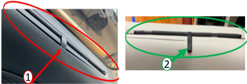
Fig. 1 Sunshade Tab