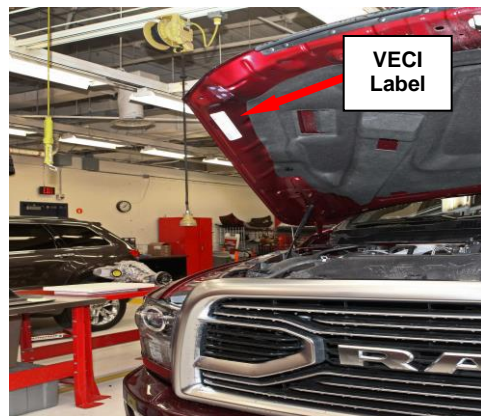
Figure 4 – VECI Label Location