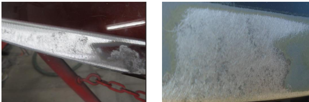
Perforation/Pitting Found After Sanding Examples (Fig. 1)

Note: If pitting is found during the sanding process, please use LOP 23-75-21-01 for up to 0.5 hours in conjunction with the 23-85 replacement LOP.