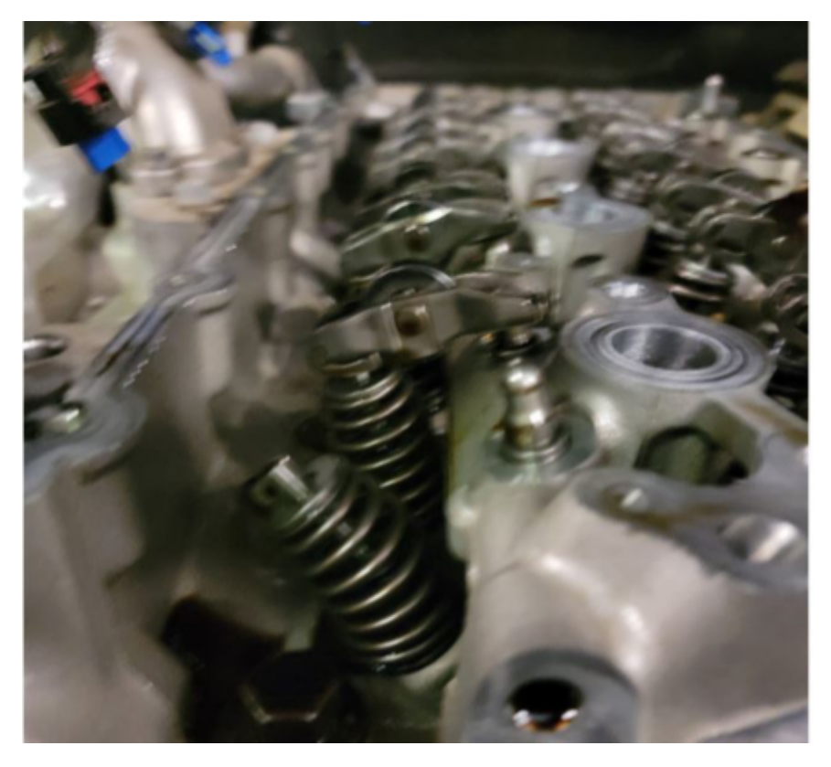
(Picture below shows a typical method used to check for worn roller followers)