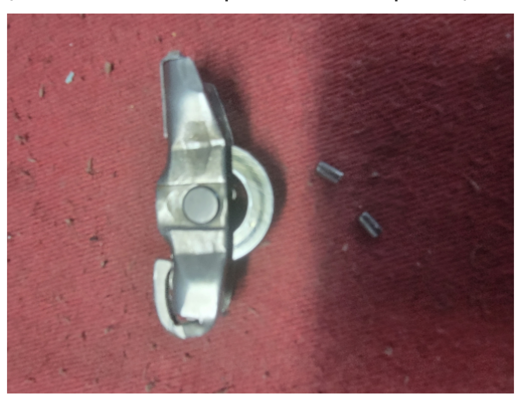
Note: Inspect the cylinder head area for any loose roller bearings and remove before reassembly. Each of the roller followers will have a total of 10 roller bearings.