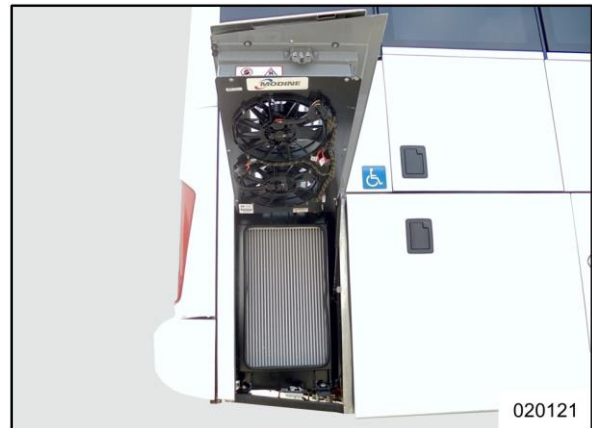
Figure 2: Access door with electric cooling fans for charge-air cooler (at the RHS of the vehicle) (CX45)