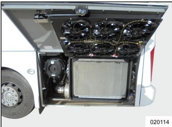
Figure 1: Access door with electric cooling fans for radiator (at the LHS of the vehicle) (CX45)

Do not run the engine for more than 5 minutes when one or both access doors (containing the electric cooling fans) are open or not properly closed.