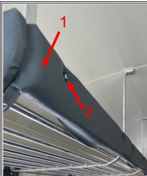
Figure 2: Luggage Rack Bumper Pad

Item 1: Bumper Pad Item 2: Mounting Screw