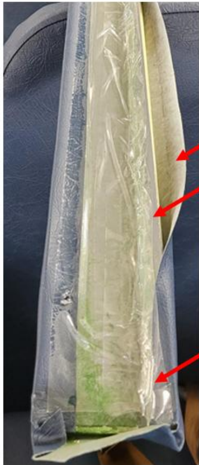
Figure 3: Bumper Pad Assembly