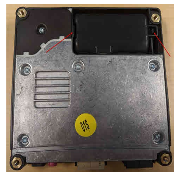
Figure 2. Backup battery compartment location.