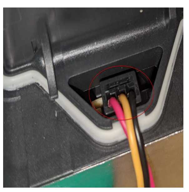
Figure 3. Backup battery connector (no release mechanism).

Remove the fuse supplying power to the data bus onboard diagnostic interface, -J533- (address word 0019). Please consult Elsa or the vehicle owner's manual as to the fuse location for the specific model on which you are working.