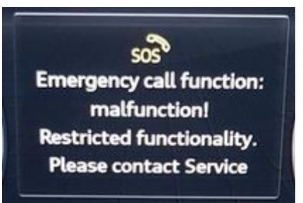
Figure 1. Emergency call malfunction warning.

• An SOS Warning might be displayed in the instrument cluster (Figure 1).