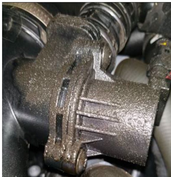
Figure 1: Cut-off valve.