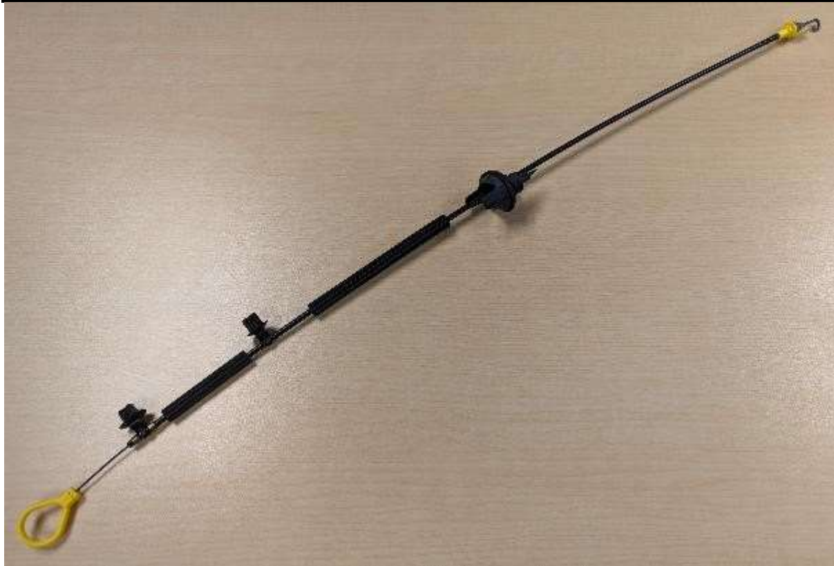
Figure 2. The Emergency Release Cable, as received as a spare part.