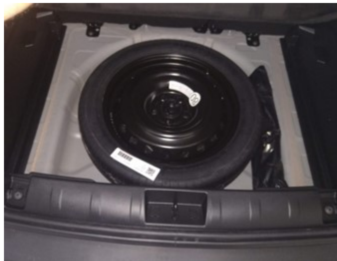
Fig. 1 Cargobox Missing

This Technical Service Bulletin (TSB) has also been released as a Rapid Service Update (RSU) 23-192, date of issue June 27, 2023. All applicable RSU VINs have been loaded. To verify this RSU service action is applicable to the vehicle, use VIP or perform a VIN search in DealerCONNECT/Service Library. This RSU will expire 18 months after the date of issue.