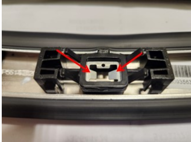
Fig. 1 Retainers Bent Out Of Position