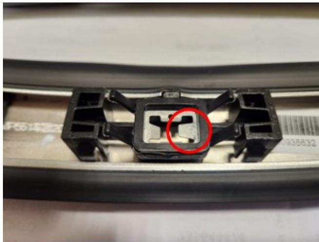
Fig. 3 Retainer Correctly Positioned