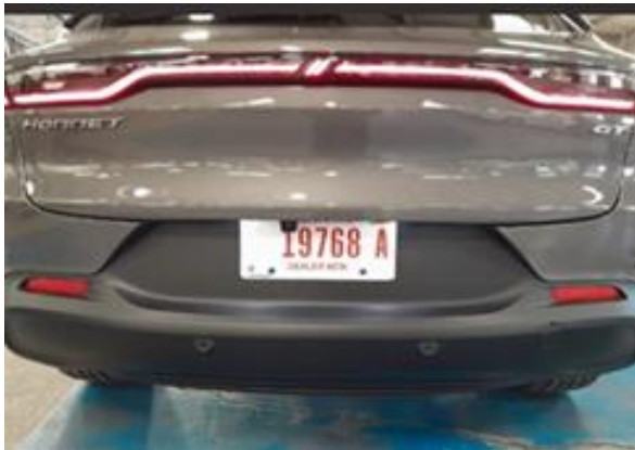
Plate Installed Incorrectly - Too High