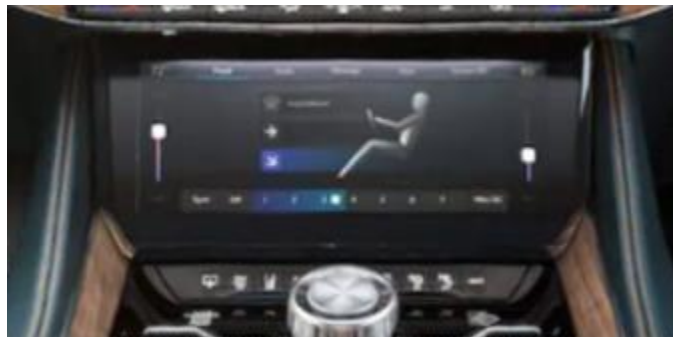
Cabin Comfort Display Module Front