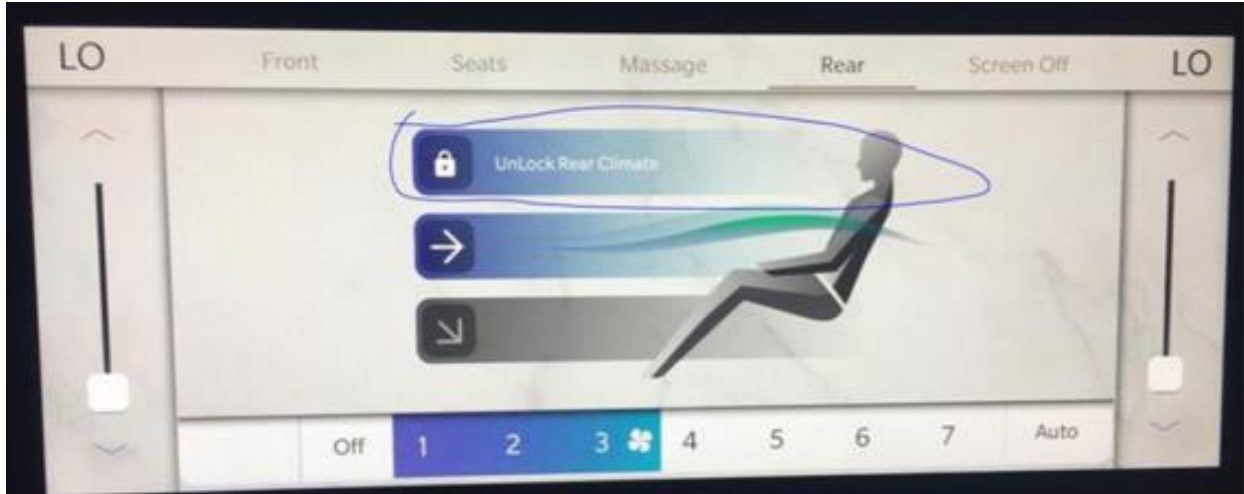
Picture of CCDM Front showing Rear Lock/Unlock Graphic