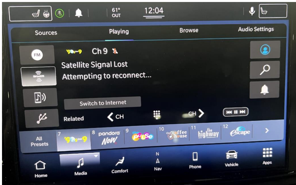
Fig 1 Radio without Rear Seat selection

Discussion: Intermittently the Rear Seat Entertainment Tab will disappear from the radio. It may be temporarily restored by doing a hard radio reset by holding the volume/power button for at least 10 seconds until radio resets. Engineering is investigating the issue. Do not replace radio.