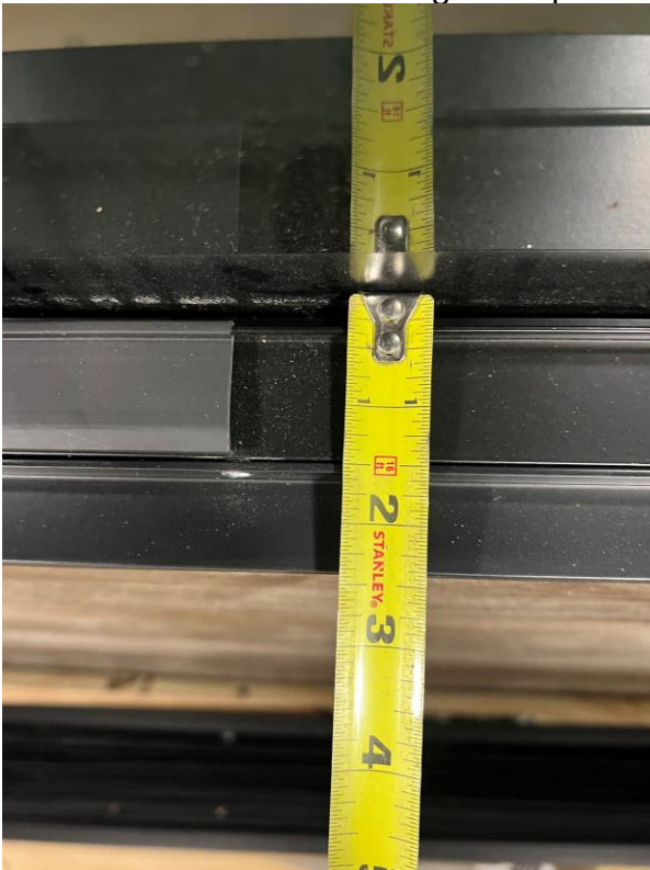
Cleer Vision measures 2 1/2" from glass to ring.

Determine that you have a Cleer Vision assembled windshield by using a tape measure to measure the interior trim ring. See photos: