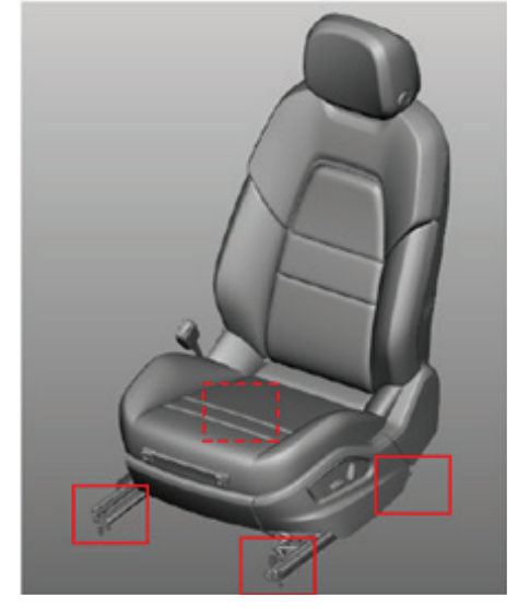
Figure 2: Seat mounting bolt locations

4. If the noise further persists, please replace the seat frame as instructed in WM 720955 – Replacing seat frame