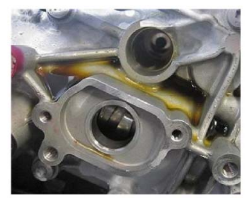
Fault type 2: Cylinder head cover leaking