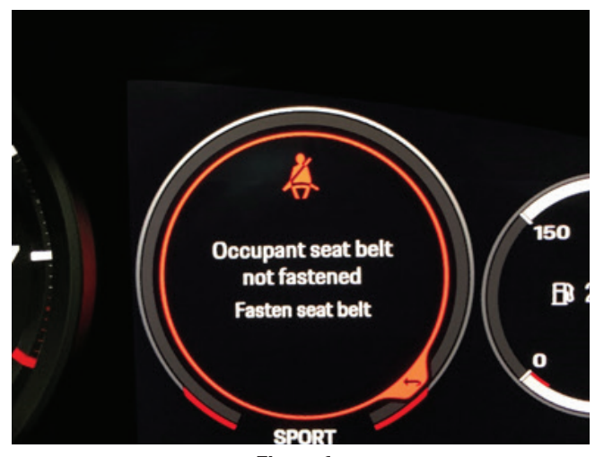
Figure 1: Red warning in the instrument cluster

The customer complains of a red warning message in the instrument cluster that reads, "Occupant seat belt not fastened. Fasten seat belt." This message appears despite all seat belts being fastened.