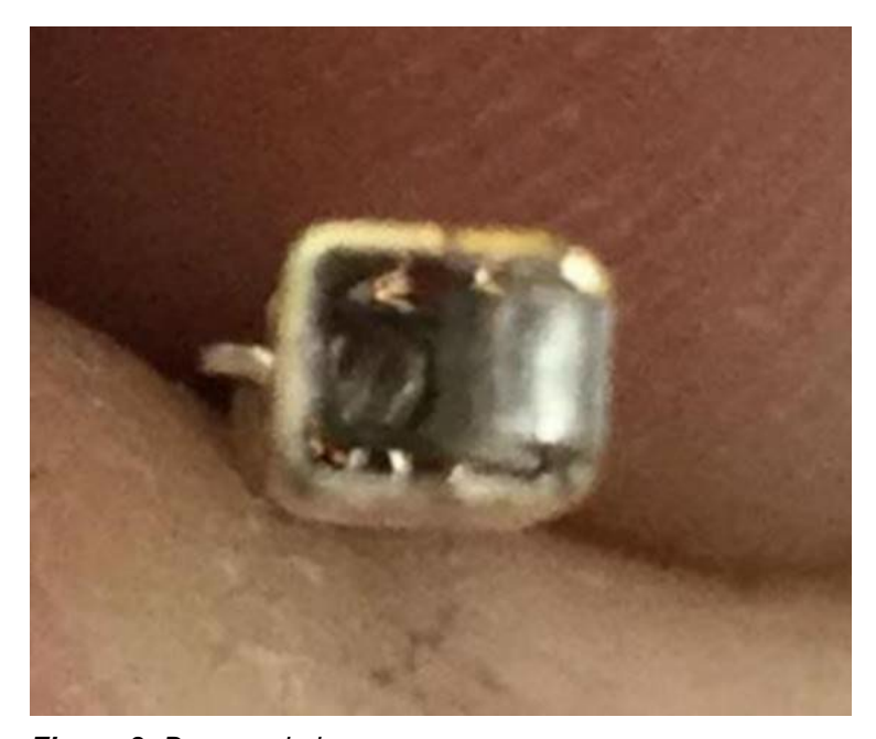
Figure 2: Damaged pin.

If damaged contacts are found, document the pin number(s) damaged and attach photos as seen in figures 1 and 2 to DOC-IT. Repair the wires as needed using