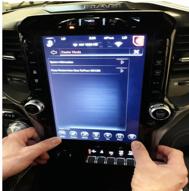
Figure 1 – Display Screen