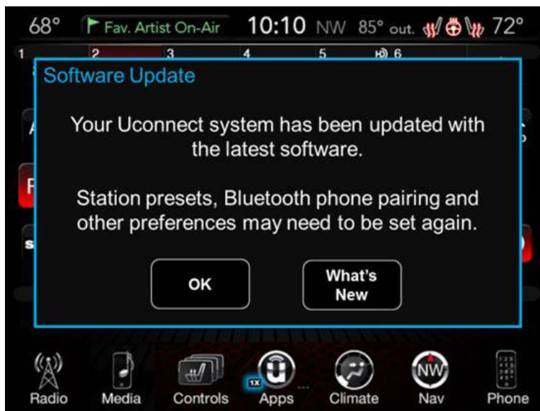
Fig. 4 Update Confirmation Screen