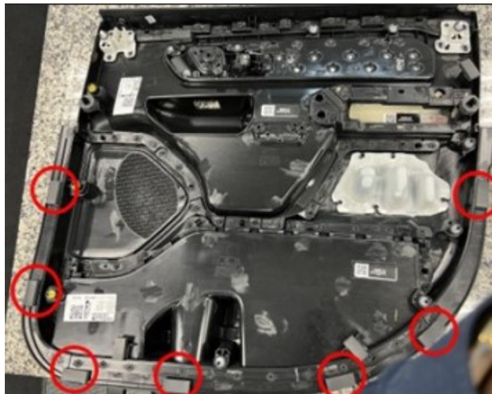
Fig. 3 Rear Door Foam Locations

NOTE: This kit should be used only for the specific door which has the buzzing noise issue.