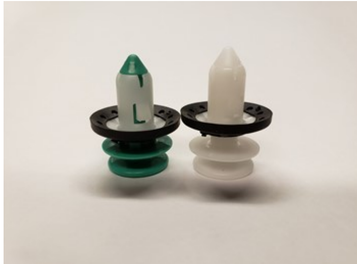
Fig. 1 Green And White Retaining Clips