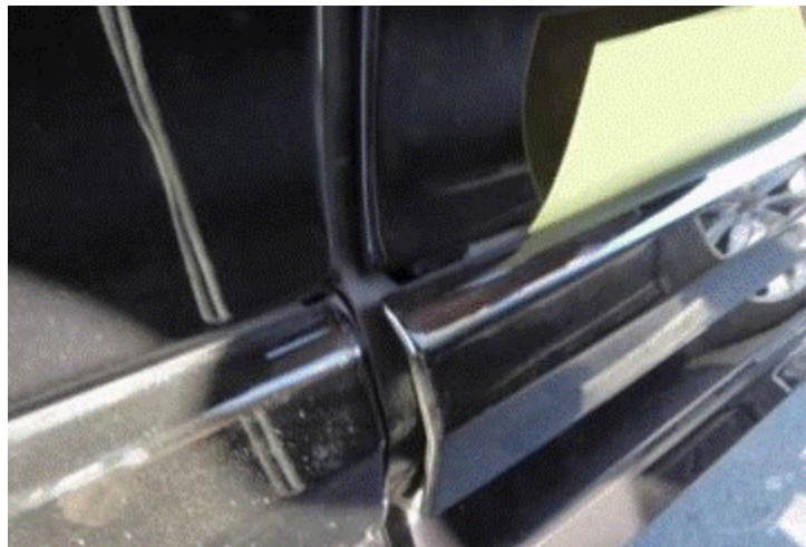
Figure 2. Alternative view of debonded door trim cover.