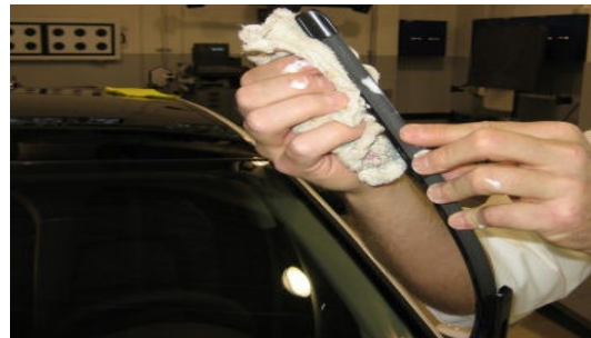
Figure 2. Cleaning wiper blades.

Tip: Do not use the 3M™ Glass Polishing Compound to clean the wiper blades.