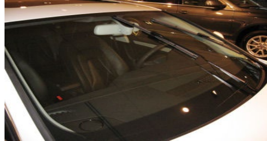
Figure 1. Windshield wipers in the service position.