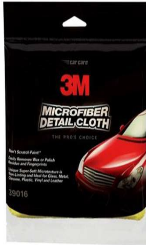
Figure 5. Detailing cloths.