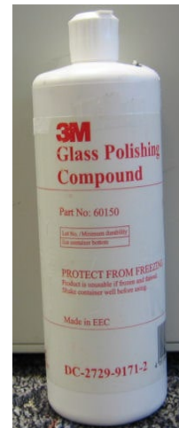
Figure 3. 3M™ Glass Polishing Compound.