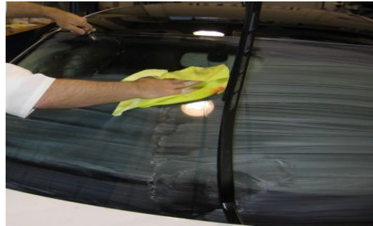
Figure 7. Rinsing the windshield.