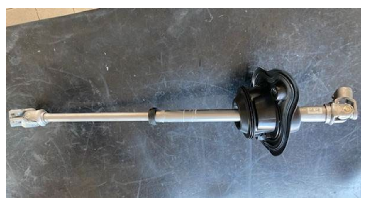
Figure 1: Intermediate steering shaft.

Then use a knife to cut off the rubber ring on the intermediate steering shaft on the sleeve side at a 45° angle (Figure 2).