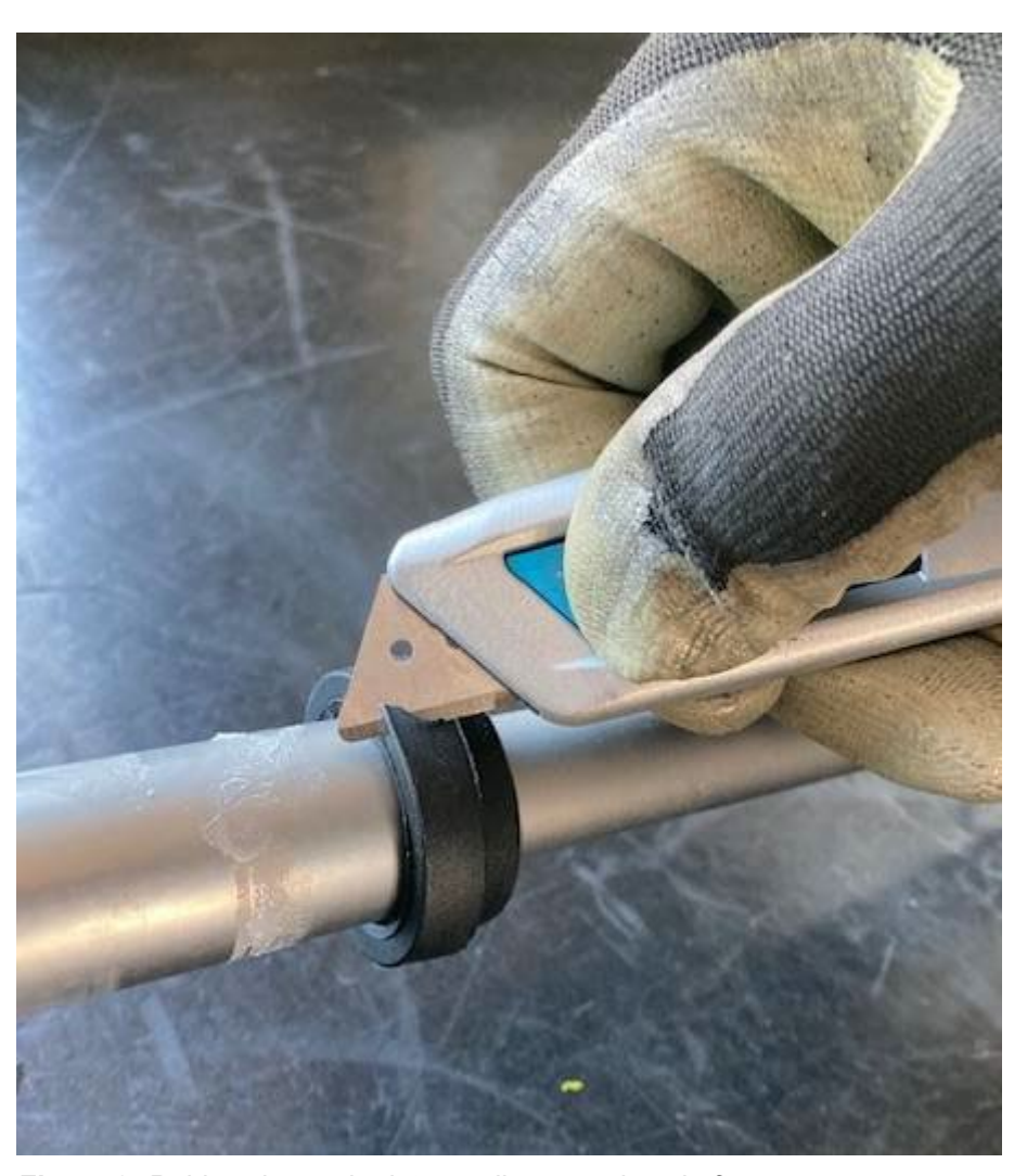
Figure 2: Rubber ring at the intermediate steering shaft.

Note: Please do not slide the rubber ring on the shaft. The sealing boot may be moved on the shaft.