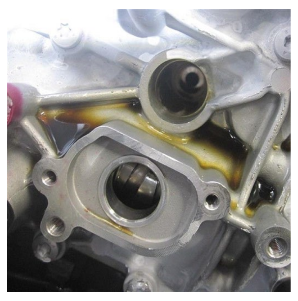
Figure 3. Locating the affected cylinder.