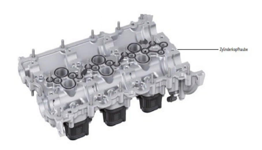
Figure 4. Remove the cylinder head cover and gasket.

6. Remove the cylinder head cover and the seal (Figure 4).