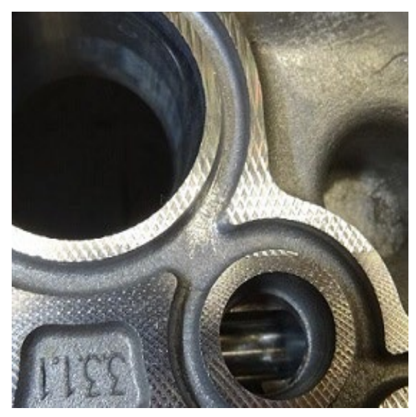
Figure 6. After the repair.

8. Install a new seal, re-assemble the camshaft cover, clean the engine compartment, and if necessary replace the noise insulation (if it is full of oil).