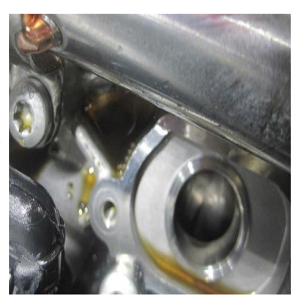
Figure 2. Oil in the Audi valve lift system.

Please take photos of the oil under the Audi valve lift system actuator as shown in Figure 2. Then upload them into DOC-IT