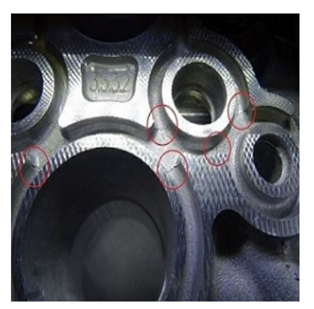
Figure 5. Before the repair.

Make sure not to damage the seal groove!