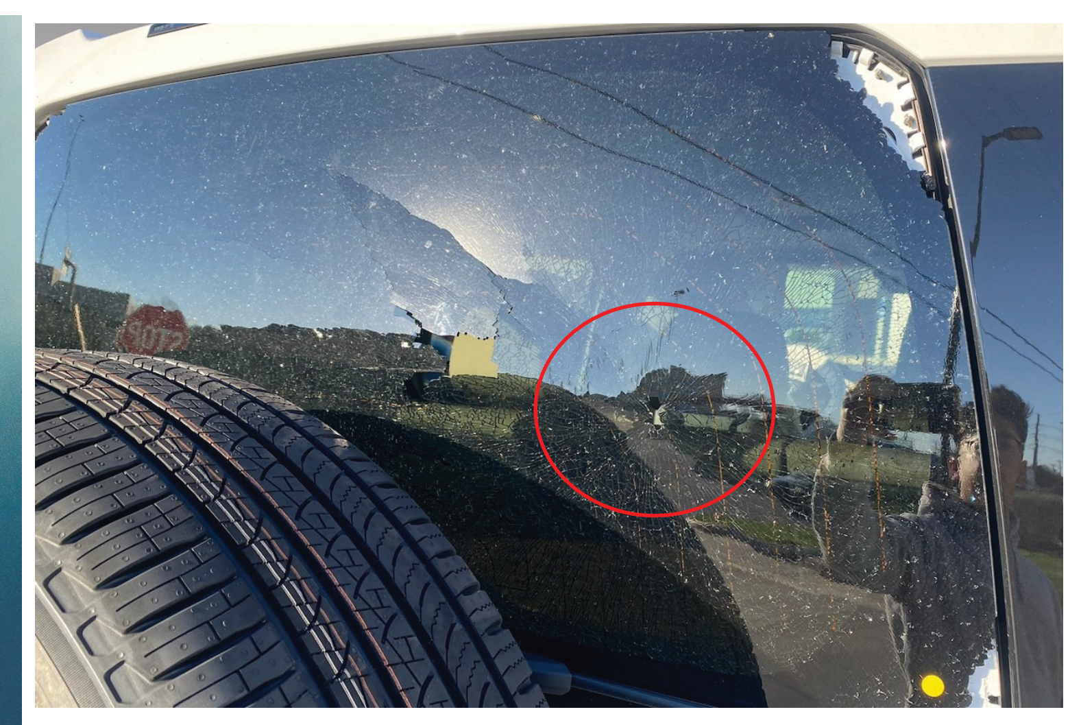
CUSTOMER LOVE | UNITY | INTEGRITY | GROWTH | IMPACT