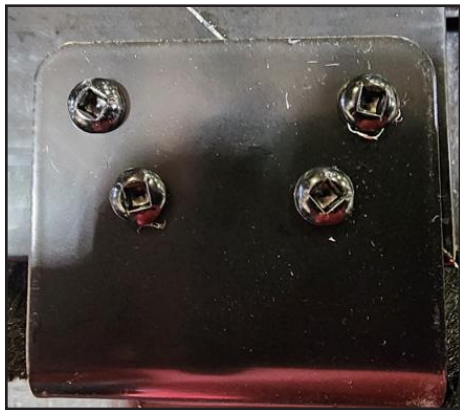
Current bracket and handle with screws

There is no change for the customer in installation or operation. There is no part number change for the doors and no price change. The change is expected to begin on a running basis in about a week.