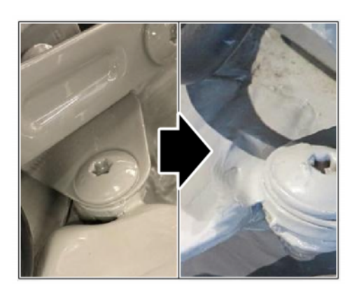
Applying sealing compound