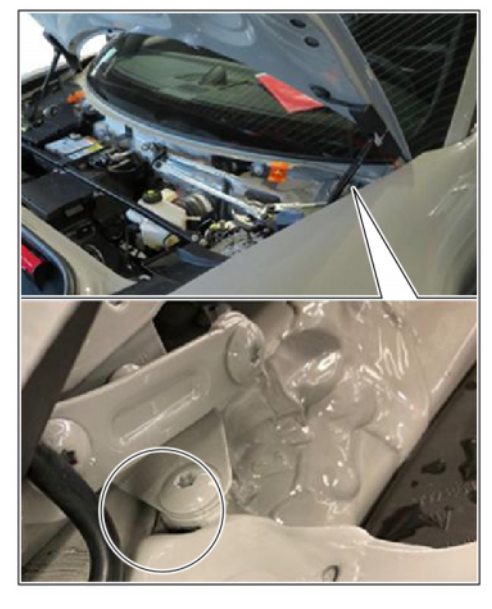
Seam sealing incomplete

Visually inspect seam sealing behind the lid hinge on the front panel on the front left side. \Rightarrow Seam sealing incomplete