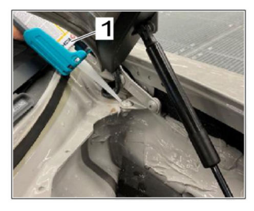
Position of cartridge