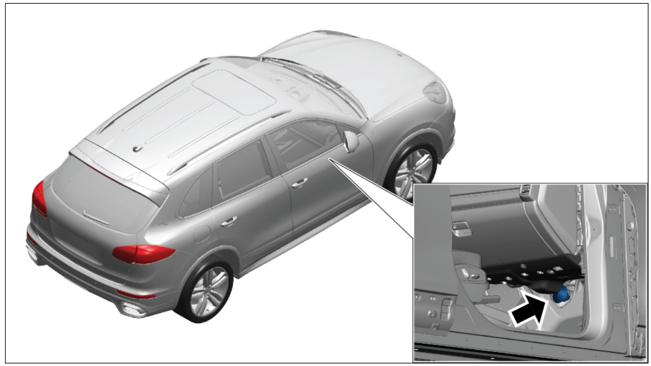
Installation position of drain hose on heating/fresh-air unit