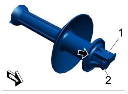
Drain hose seating