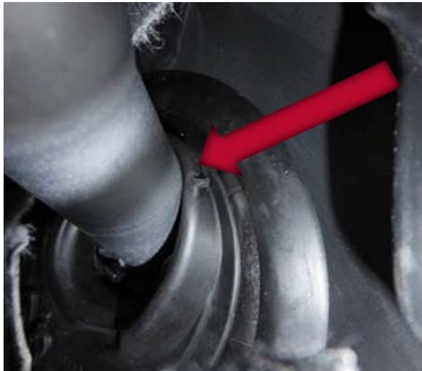
Figure 1. Steering shaft rests on the sealing sleeve (also known as sealing lip).