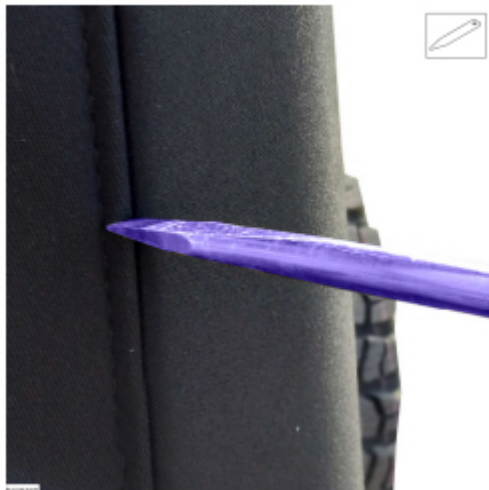
Figure 3 – Left side shown, right side similar.